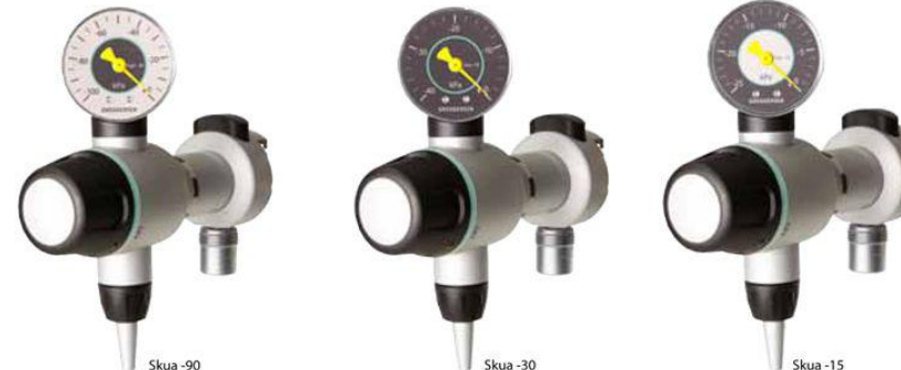
SKUA VACUUM REGULATORS, AIR, RAIL-MOUNTED UNIT NIST, WITHOUT CONNECTING HOSE

Connecting hose, see product group accessories