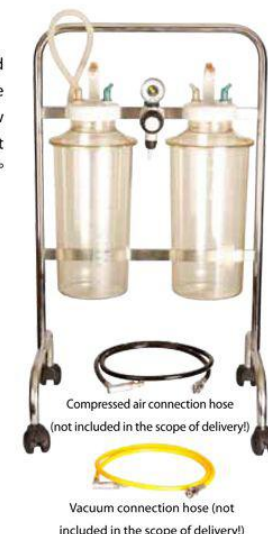
Compressed air connection hose (not included in the scope of delivery!)

Please find the technical data for the respective regulator on page 05 or 07.