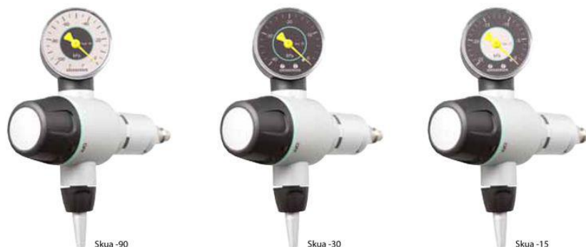
SKUA VACUUM REGULATOR, AIR, PLUG-IN UNIT DIN