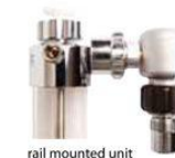
rail mounted unit