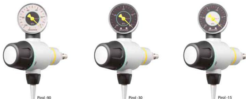
PIROL VACUUM REGULATOR, VAC, PLUG-IN UNIT